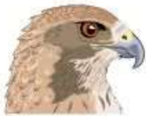
Red-Tailed Hawk short, strong bill, hooked for tearing flesh