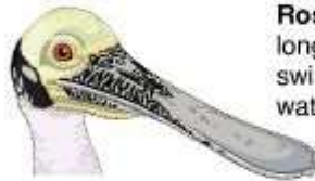
Roseate Spoonbill long, flat bill for swinging through water to catch fish