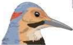
Northern Flicker long, chisel-like bill, used to dig insects out of soft wood or the ground