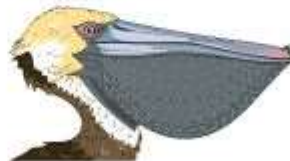
Brown Pelican very long bill with large throat pouch, used to scoop up fish