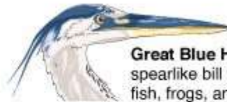
Great Blue Heron spearlike bill for jabbing fish, frogs, and shellfish